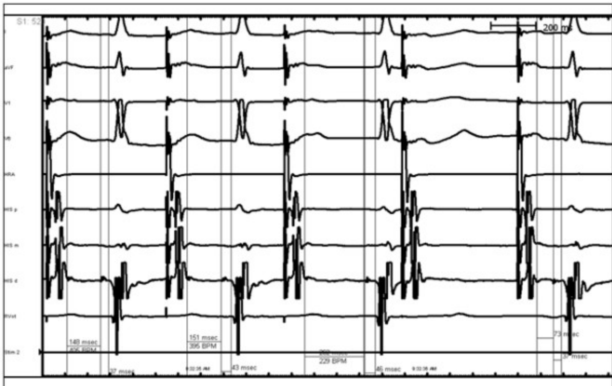
Figure 2. Atrial Extrastimuli Demonstrating Intrahissian Type I Second Degree Block.